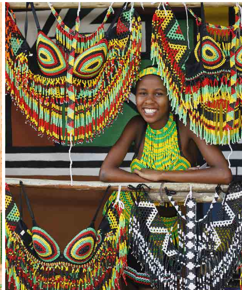
DURBAN, SOUTH AFRICA