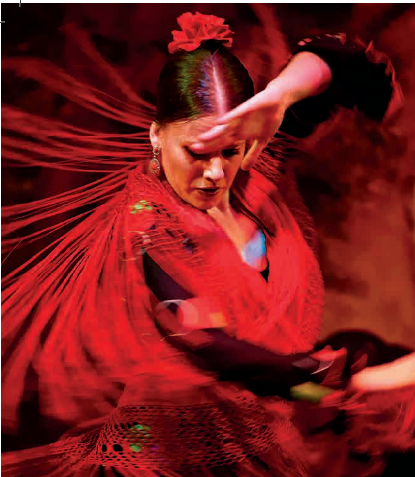
FLAMENCO DANCER, VIGO, SPAIN